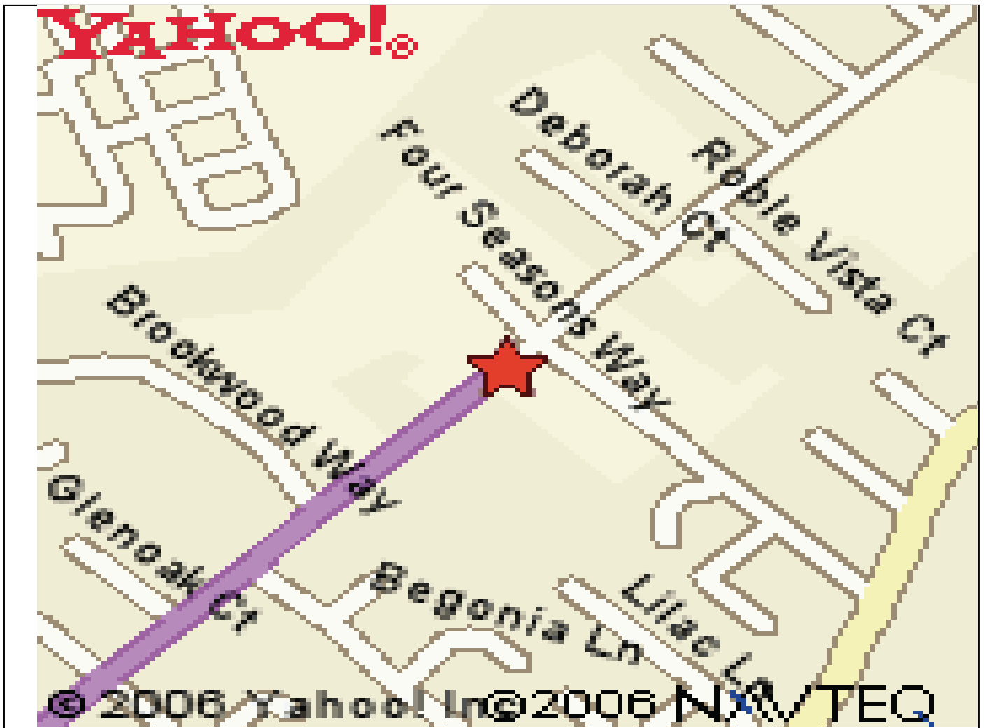
Maps to the Seven Day Adventist Church at 1877 Hooker Oaks Ave.