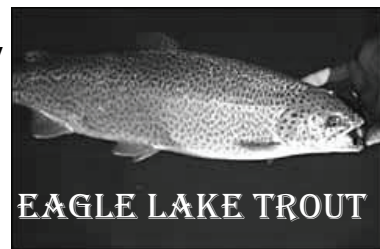
EAGLE LAKE TROUT