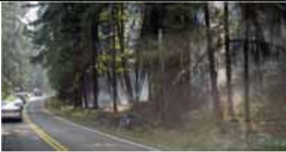
Fires burning on the roadside along highway 32 near Potato Patch Campground during the lightening caused fires during July 2008