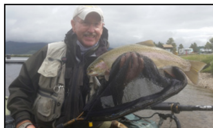
A Cutbow about 20 inches.

We finally made it home after our 12 days on a tough road trip with a lot more new memories and pictures.