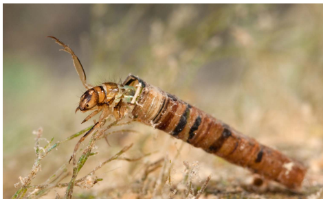
ENTOMOLOGY COURSE DEAL