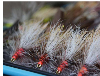
CRAFTING YOUR FLY BOX COURSE DEAL