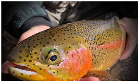
TOP TROUT FLIES COURSE DEAL