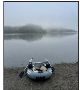
Stone Lagoon, Humboldt County