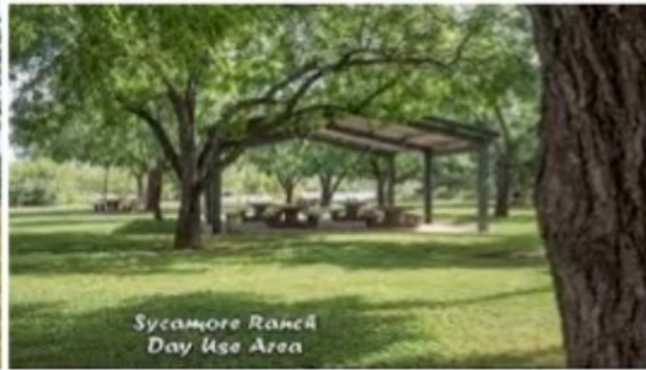
Welcome to Sycamore Ranch Park – Yuba Fest 2023