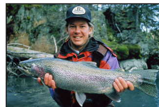
Steelhead trout are the same as freshwater coastal rainbow trout, however, they are anadromous. Born in freshwater, they migrate to the ocean, then come back to spawn in freshwater. They can spawn year after year, unlike salmon.