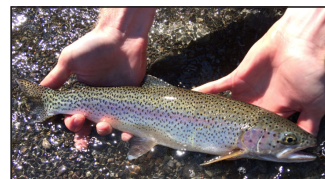
Coastal rainbow trout which lives its lifecycle in freshwater.

To qualify for The Challenge, any coastal rainbow trout or steelhead caught in waters draining to the Pacific Ocean, including the near-shore marine environment, qualify regardless of elevation. Both hatchery-raised and wild trout are accepted.