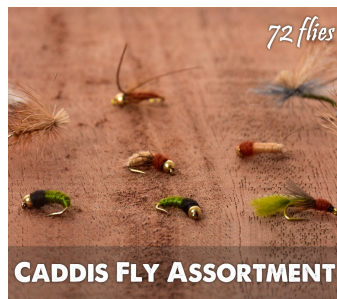
Caddis Lifecycle Assortment $119.00 ADD TO CART