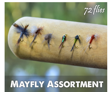
Mayfly Lifecycle Assortment $119.00 ADD TO CART