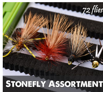
Stonefly Lifecycle Assortment $119.00 ADD TO CART