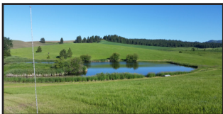
A spring time picture of the pond.