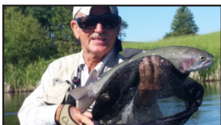
These are called Farm Trout for lack of a better name.....